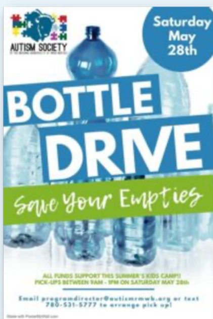
Drivers/Pickups | Wood Buffalo Volunteers

If you have any questions about volunteering, please reach out to autismsupport@autismrmwb.org