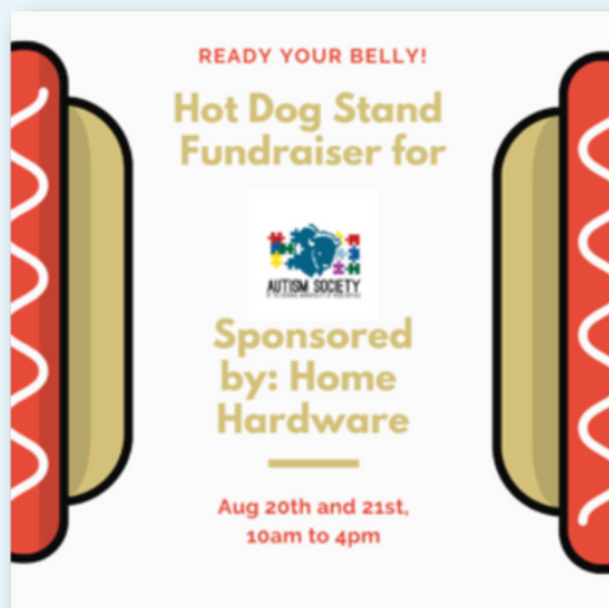
Home Hardware Hotdog Stand | Wood Buffalo Volunteers by FuseSocial