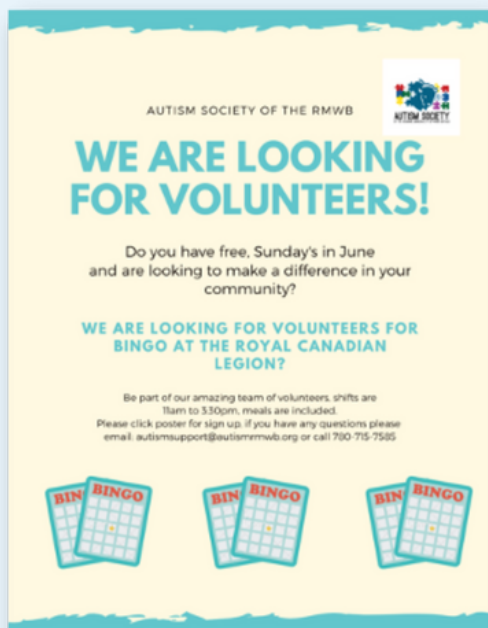
Bingos | Wood Buffalo Volunteers by FuseSocial