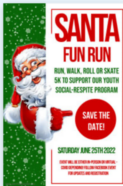
Santa Fun Run | Wood Buffalo Volunteers